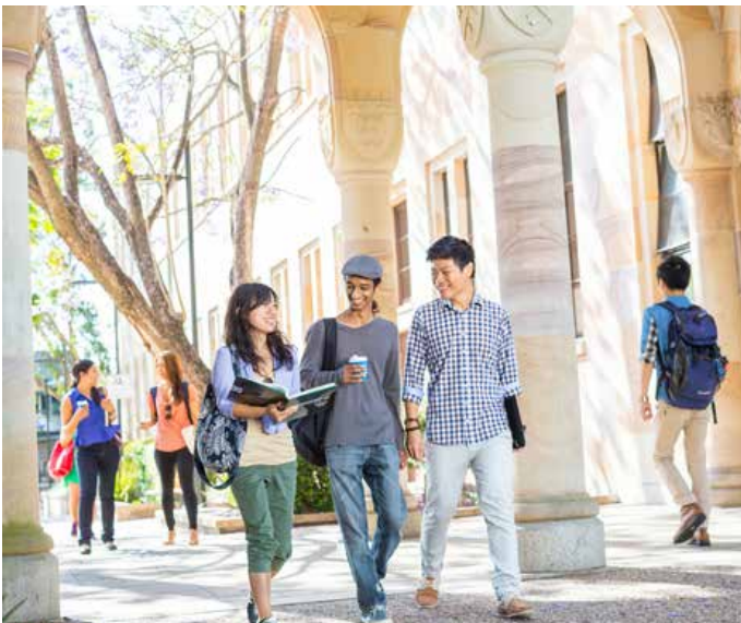
Students entering the Great Court at The University of Queensland

UQ has provided the stepping-stone for thousands of graduates to become leaders in all areas of society and industry, making it one of the most prestigious universities in the world. IES Foundation Year graduates make up nearly 30% of international students in UQ undergraduate programs.