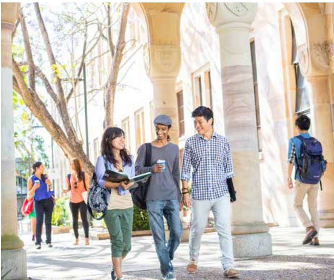
Students entering the Great Court at The University of Queensland

UQ has provided the stepping-stone for thousands of graduates to become leaders in all areas of society and industry, making it one of the most prestigious universities in the world. IES Foundation Year graduates make up nearly 30% of international students in UQ undergraduate programs.